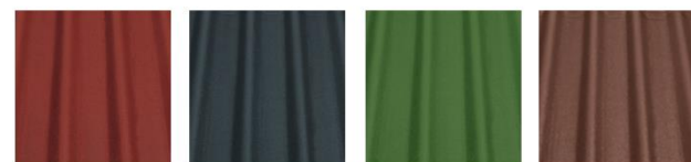
Red Black Green Brown