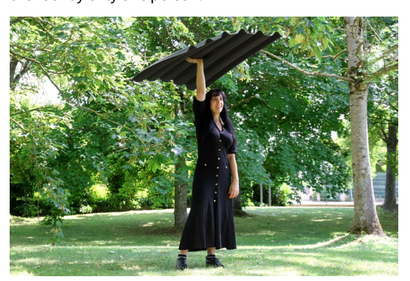
*Timing tests done internally with a first time roofer DIYer with ONDULINE EASYFIX® sheets. V3 - 2023/09 - Document