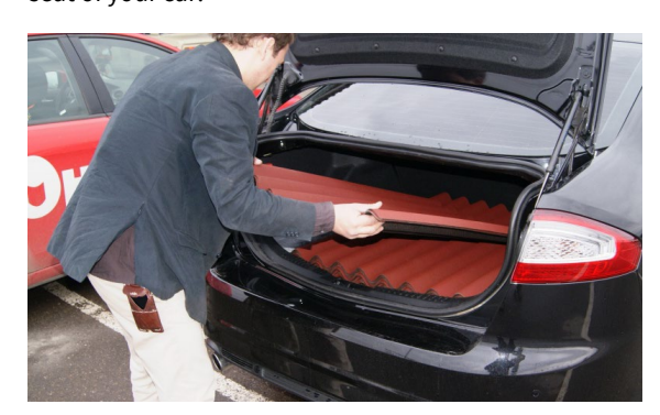
Second, ONDULINE® sheets can be transported up on the roof by only one person.

First, the sheets are easy to transport in a simple car, no need to have a particular means of transport such as a van or a small truck. Our compact versions (ONDULINE EASYFIX® COMPACT, ONDULINE EASYLINE®) simply fit in a car truck and our standard versions can fit in the back seat of your car.